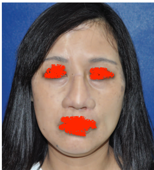
Fig. 4. Postoperative view, 24 months after ulnar forearm reconstruction with subsequent framework reconstruction, paramedian forehead flap coverage, and three refinement operations for improved airway patency and contour.

proximal wrist crease. 12 Perforators were larger than those arising from the radial artery, and each was capable of perfusing the flap individually. 14 Accordingly, the ulnar forearm flap can be segmented into two or more independent flaps, each supplied by one or more perforators; this may be beneficial for coverage of topographically complex defects.