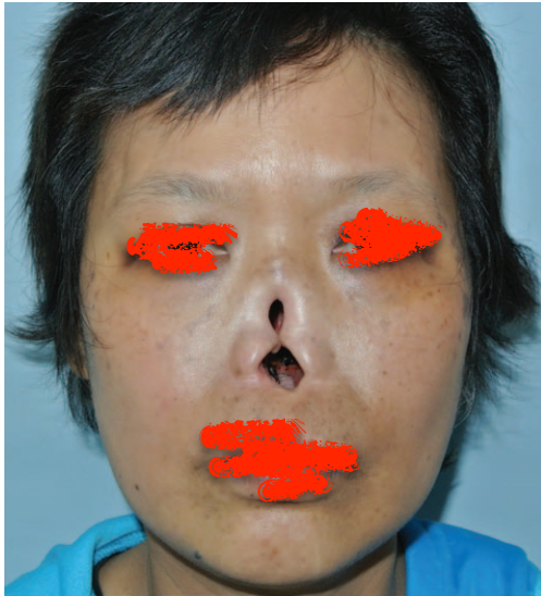
Fig. 1. A 48-year-old woman with lymphoma was treated with chemotherapy and radiation therapy that led to a nearly total secondary nasal defect. Reconstruction began 1 year later to ensure she remained cancer-free.