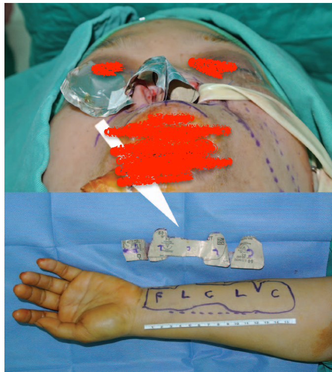
Fig. 2. A template is fashioned and a Penrose drain is used to facilitate pedicle transfer to the left facial vessels. Transposing this to the ulnar forearm, a 16-cm flap design emerges with five components: the covering flap (C) (proximal), vault lining (L) (proximal), columella (C) (distal), vault lining (L) (distal), and nasal floor (F).

Under tourniquet control, the radial-side flap incision is made. Suprafascial dissection continues to the ulnar border of the flexor digitorum superficialis. The ulnar neurovascular bundle is identified subfascially and septocutaneous perforators are visualized. The proximal incision is made and the ulnar artery dissected in retrograde fashion, and then ligated distally. The vascular pedicle is